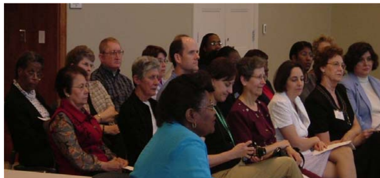
Audience enjoying CALA LIBRA Award ceremony.

"A house without books is like a room without windows. No man has a right to bring up children without surrounding them with books.... Children learn to read being in the presence of books." - Horace MANN (1796-1859)