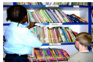
(Picture - Students at St. Mary's Magnet Academy Media Center selecting print materials)

In addition to print materials, the media center collection includes videos, DVDs, laser discs, CDs, Internet access, a media distribution system, and Follett Destiny library management software.